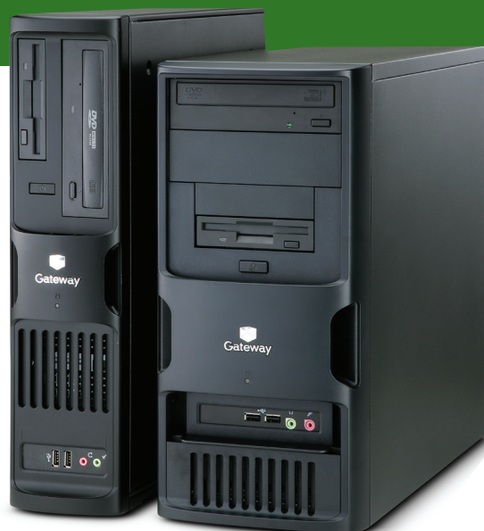
E-2600S Space-Saving 3-Bay BTX

Gateway's BTX motherboards have a more direct airflow path to keep the CPU, memory and graphics cards cooler. With the large system fans efficiently moving air over the motherboard, separate fans are not needed for these components – increasing reliability.